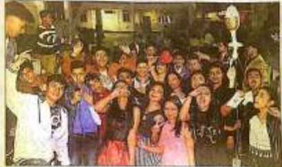
तुलाज इंटरनेशनल स्कूल परिसर में 69वां गणतंत्र दिवस के अवसर पर छात्रों के विभिन्न श्रेणियों के लिए 'गुड लक सेरेमनी' का आयोजन किया।