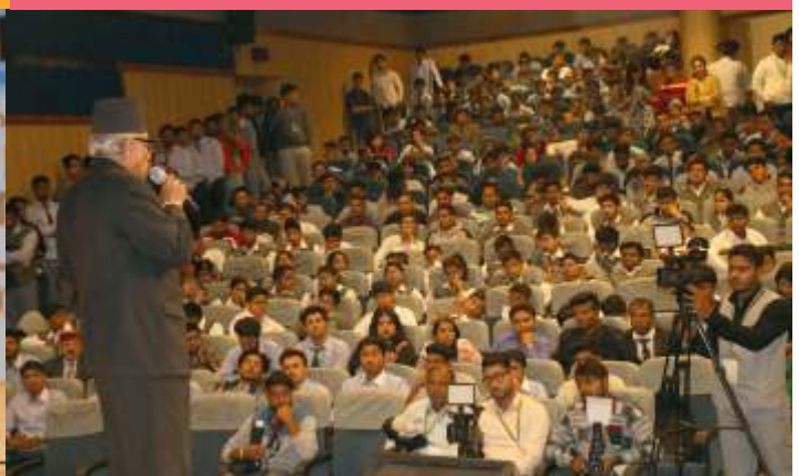
DR. MOHAN AGASHE ADDRESSING THE STUDENTS